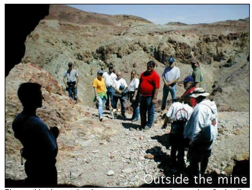
Plan on this trip next time its up-great country to view, explore & wheel!