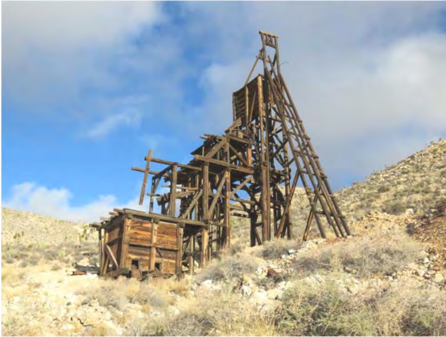
Mine shaft lift system above Sunset below