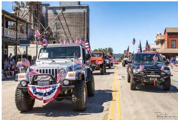
On the parade route heading North on Main St

This parade is always a lot of fun in that there are usually a large number of entries with children, several mounted groups (including the San Luis Obispo County Sheriff's Department