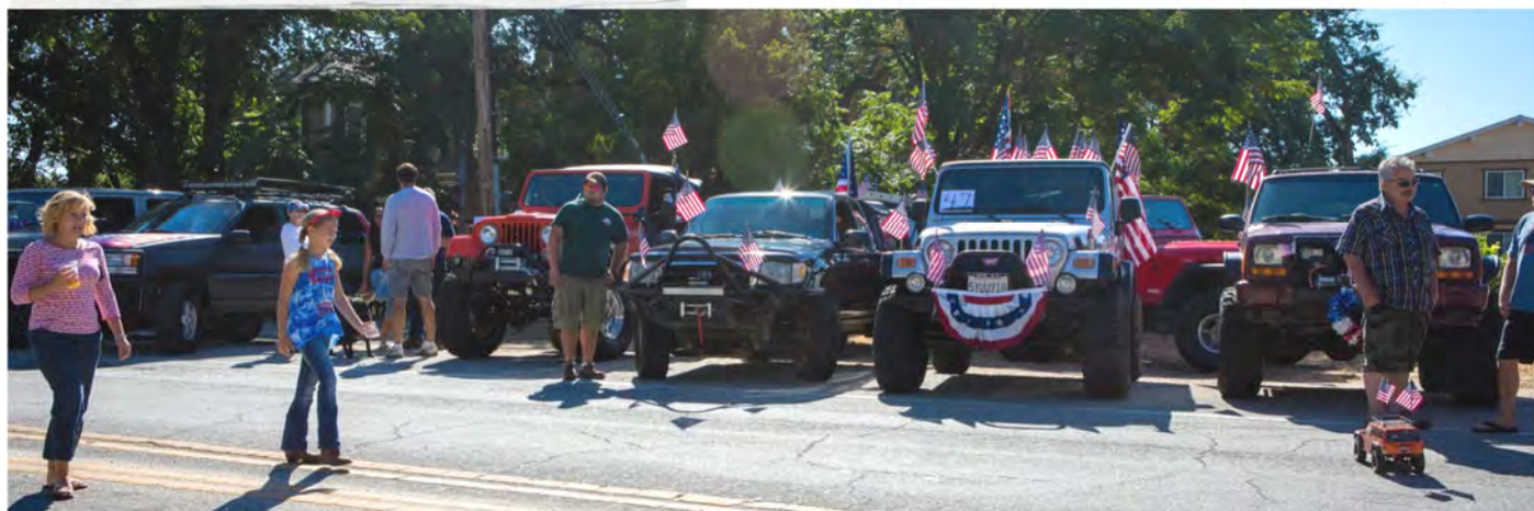
Pre-parade line up

A great time was had by all of us who attended and I highly recommend being a participant in the future if you haven't been in the parade already. It's totally fun and very family oriented. Just remember to have an investment in patriotic decorations on hand.