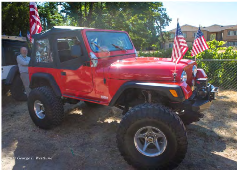
South on Crocker

Then when some candy got thrown (no idea who threw it, but some got thrown) the kids