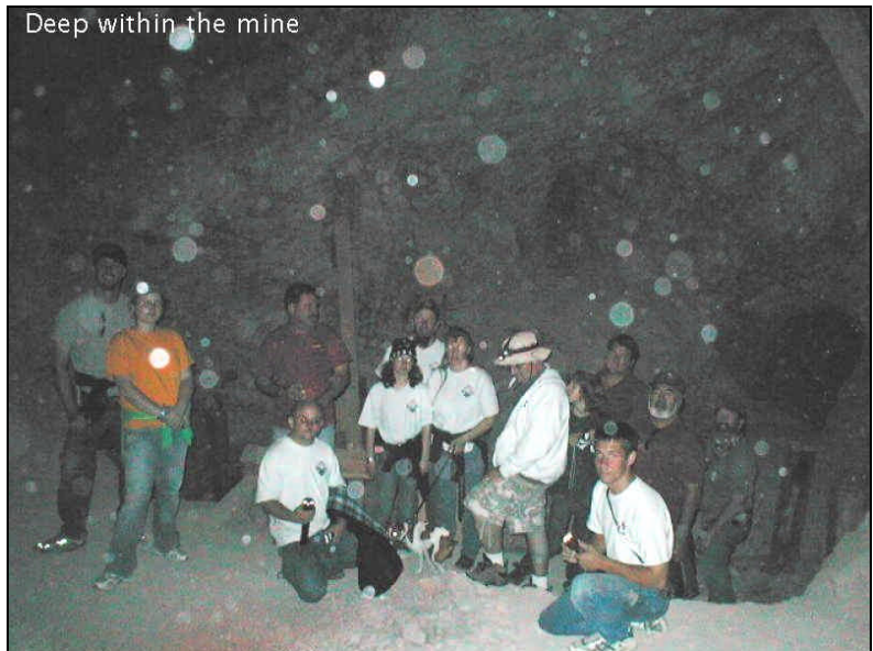
Deep within the mine