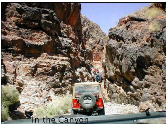
In the Canyon