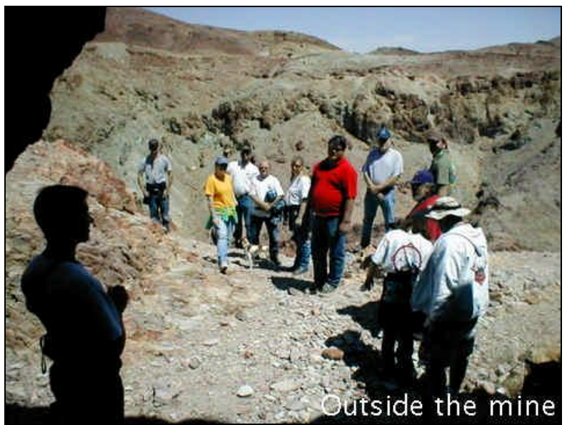
Outside the mine

Plan on this trip next time its up-great country to view, explore & wheel!