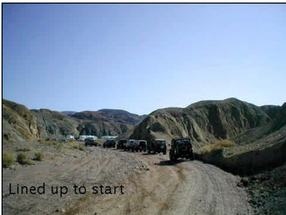
Lined up to start