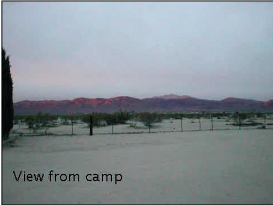
View from camp