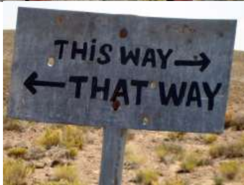
Sign Sign found in Garfield Flats.

Nearly 66,500 acres are public land. Among the sights worth visiting are Teels Marsh and the ghost towns of Marietta and Candelaria. (Marietta has a few hardy souls in it yet so it might not really qualify as a ghost town.) Also located along the western edge of Mineral County is the Excelsior Moun-