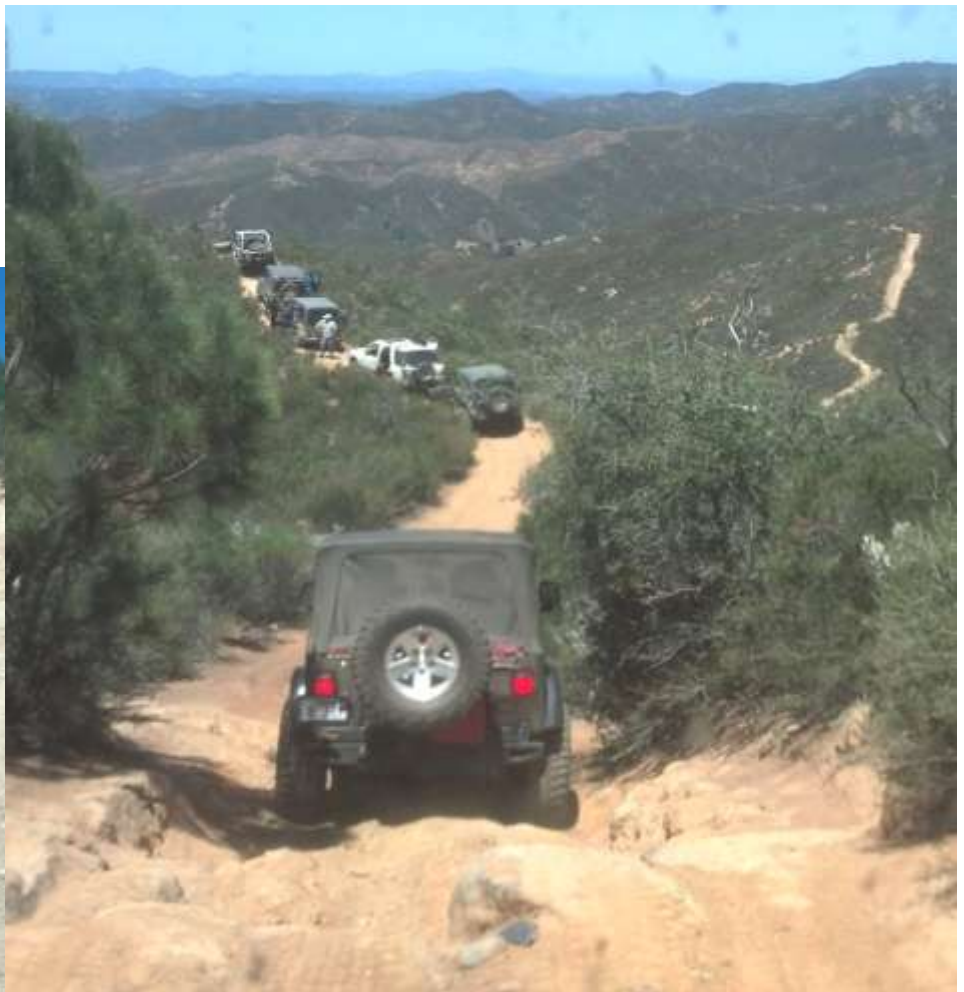
Approaching the steps