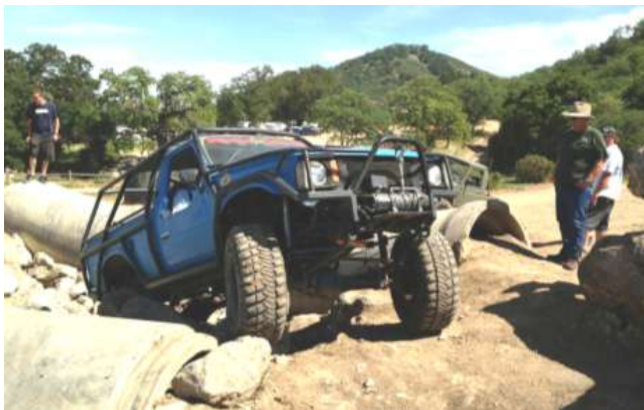
"Now don't go breaking anything."

Kenn pulled at least 3 people out of the mud pit, non from our group, and all claimed their friends made them do it.