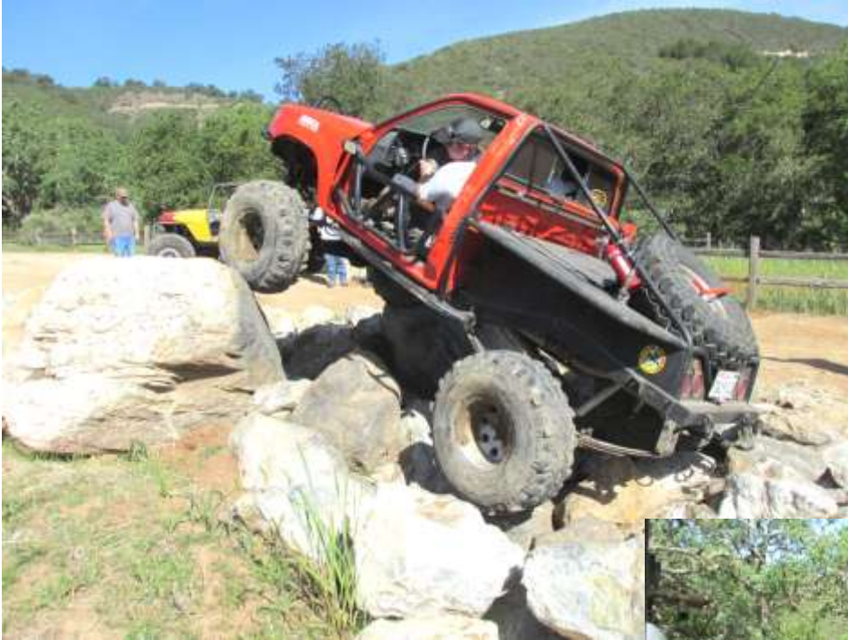
Additional photos from Hollister