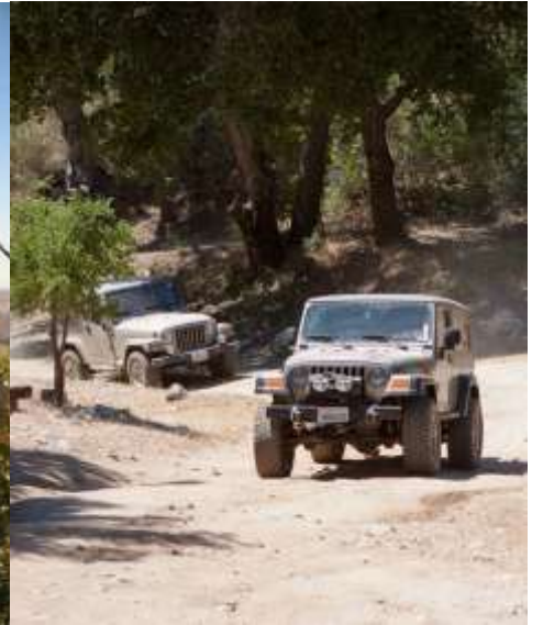
Returning warriors