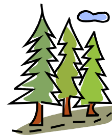
Trail Scenery