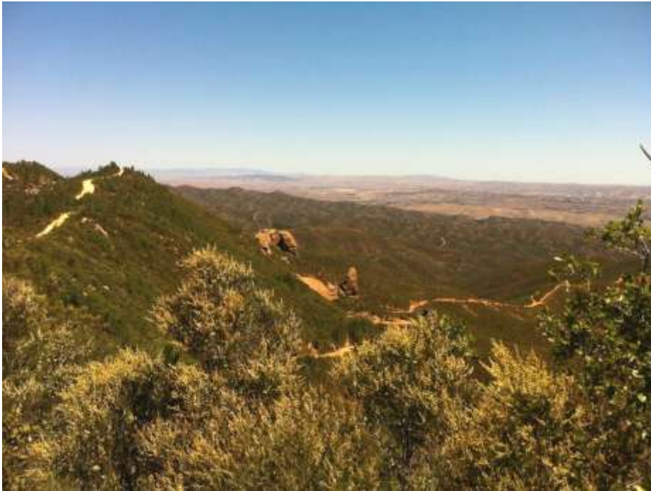
Trail Scenery