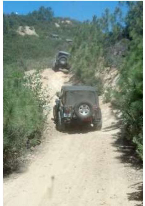
On the Trail