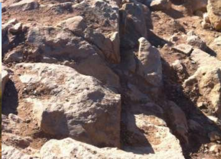
Going up the Steps!