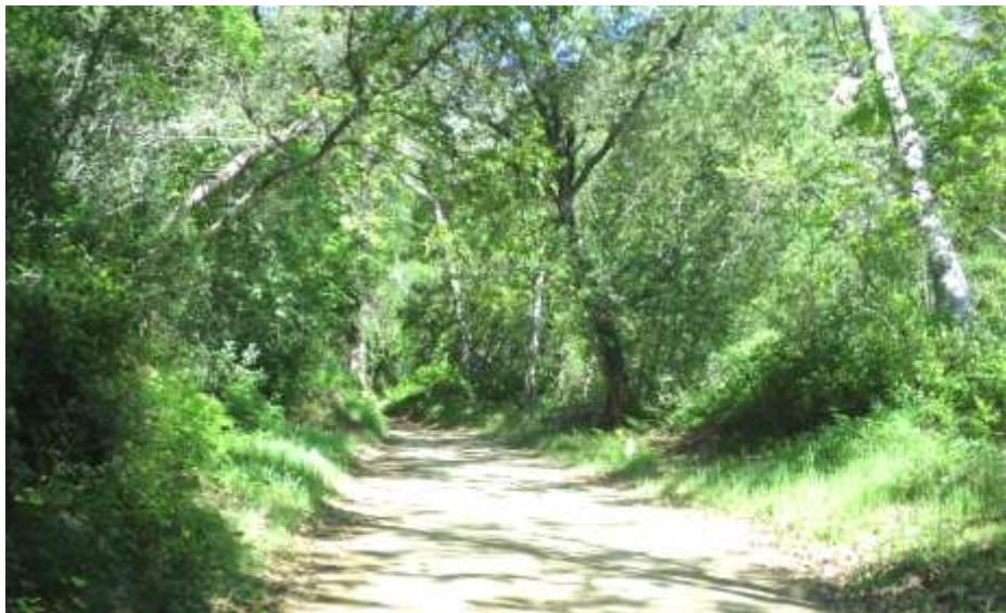
Country Road.