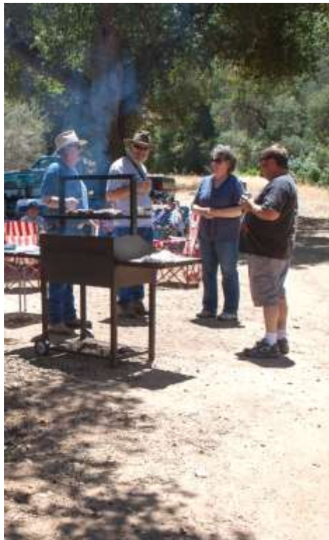
Bat-B-Que chatter