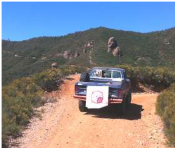
Leading the way