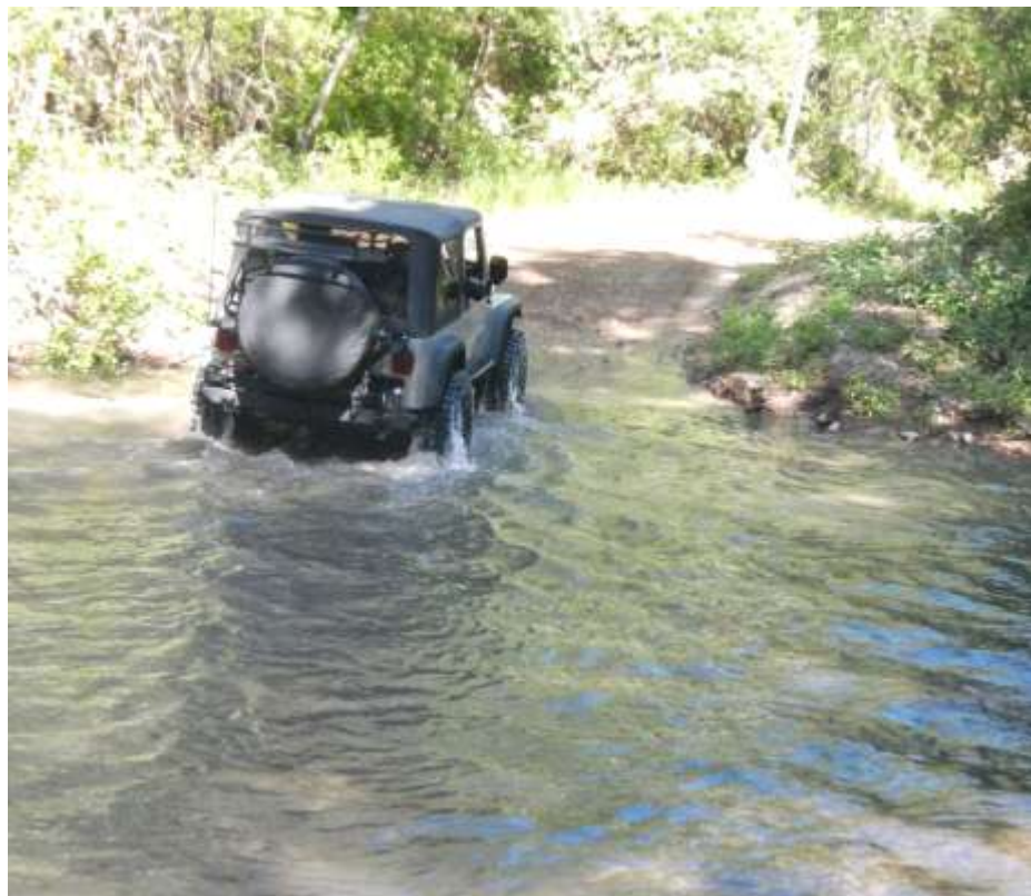
Creek crossing.

about. As we're walking, you can see the creek on the right hand side of us and nice rock formations on our left with ferns growing out of them. The creeks were showcasing small fish and salamanders. We walked across two more creeks bringing us to a steep incline. Once up the incline you can see the Big Falls lower area which includes a nice 6-10ft deep pool area, natural rock water slide, and a deeper pool of about 20ft deep. There is a nice