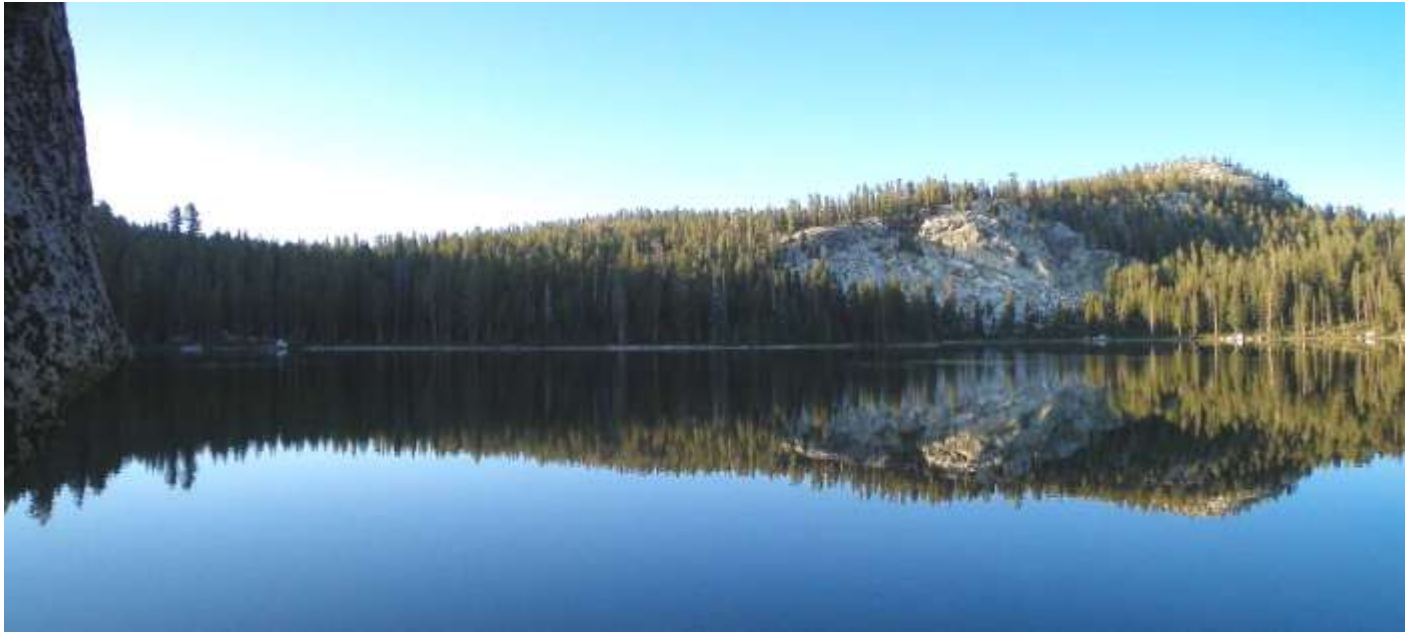
Dawn at Coyote Lake and a view of the mountain on the right that was the subject of a hike